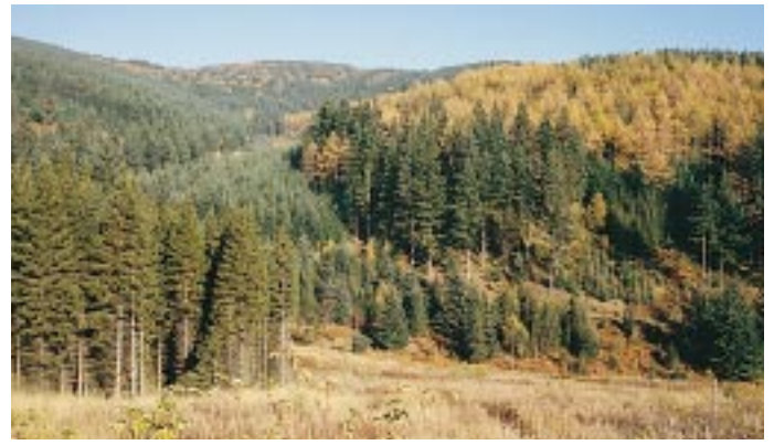
Conifer forests like this with mixed ages and species of trees are the best hope for the long-term survival of the red squirrel.

Some of these measures will result in loss of future revenue but they will also have other positive effects for wildlife conservation.