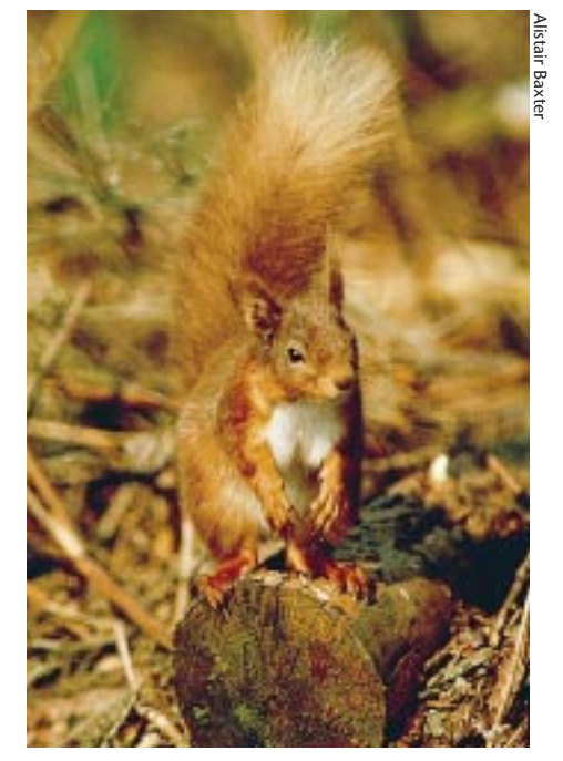
Red squirrels are now largely confined to conifer forests in upland regions.

Because grey squirrels (greys) are now an established part of our forest wildlife, with a population of 2.5 million, it is not practical to aim to re-establish red squirrels (reds) to their former range. The current distribution of reds is shown on the map (Figure 1). Greys continue to expand their range and this threatens the remaining red population. For example, where major red populations meet the potentially expanding greys (the 'red/grey interface') reds are usually displaced within 15 years of the arrival of greys. However, the population dynamics are not clearly understood. Many Scottish Highland conifer forests could remain core areas of suitable habitat where reds will not be threatened, but there is no room for complacency, as greys have colonised extensive conifer forests in Derbyshire, North York Moors and Thetford. Also, many of the discrete Welsh, northern English and southern Scottish red populations are likely to contract further.