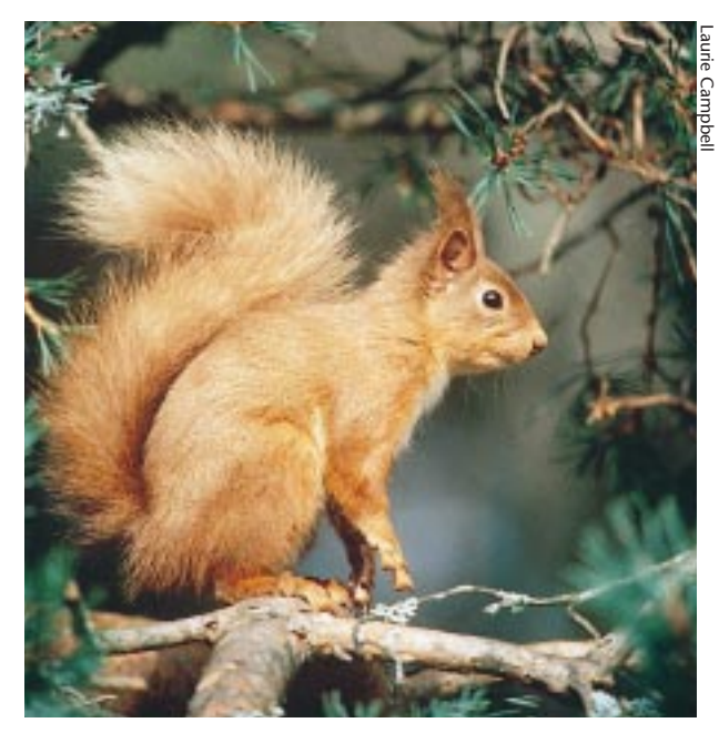
Time–area counts are useful in woods with an open structure such as old pine woods.