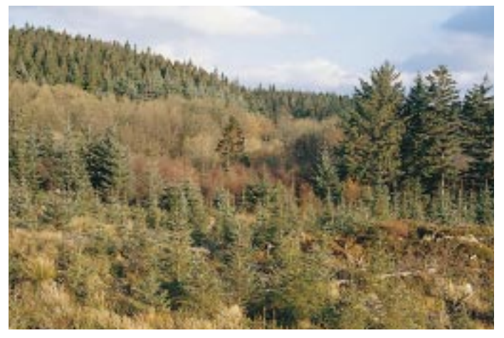
Spruce forest with good red squirrel habitat: 3 age classes, both Norway and Sitka spruce and small-seeded broadleaved species.