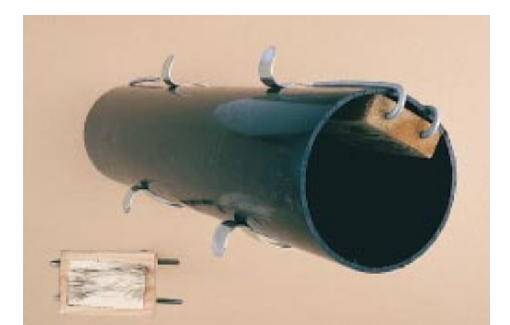
A hair-tube and removable sticky block (bottom left) with squirrel hair attached.

An area of conifer forest between 2000 and 5000 hectares (ha) is considered to be ideal to conserve a population of reds with a high chance of success. It may be possible to support a small viable red population in core reserves of as little as 200–300 ha, together with buffer zones (see Habitat management), by maintaining a suitable age structure and diversity of trees and shrubs, with grey control where needed. Such areas will always be under threat from greys, and more extensive habitat improvement to adjacent woods should be planned. For owners of smaller woodlands, the only possibility of conserving reds